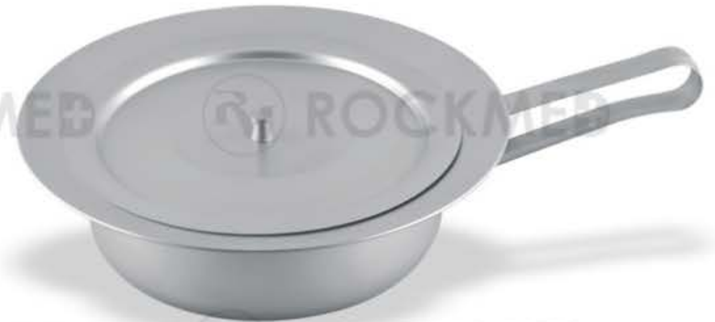
BEDPAN PERFECTION TYPE