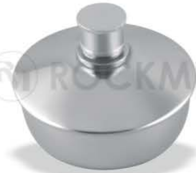
ALCOHOL LAMP 60.901.00