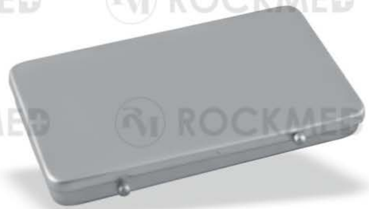
NEEDLE CASE RECTANGLE L W H 60.807.00 150 x 90 x 12 mm