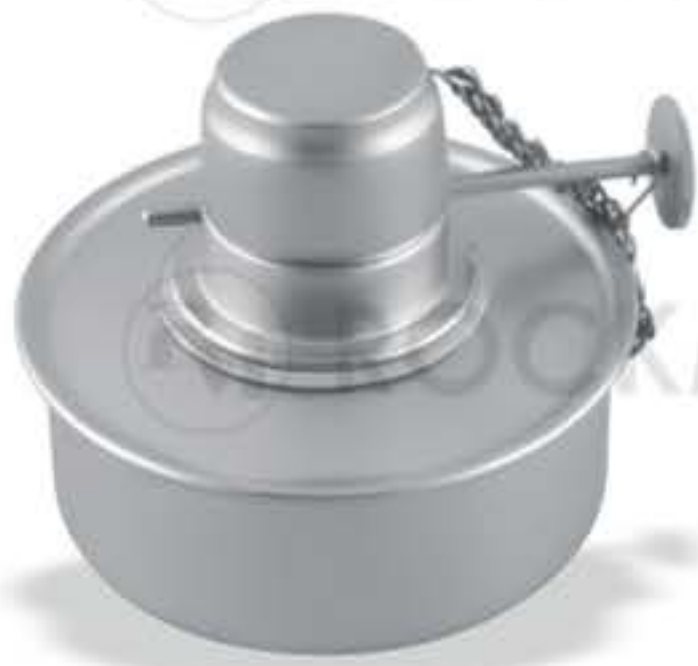
ALCOHOL LAMP MHH.144.001 Small MHH.144.002 Large