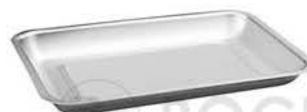
MHH.110.001Z 125 x 75 x 25 mm / 5 x 3 x 1"