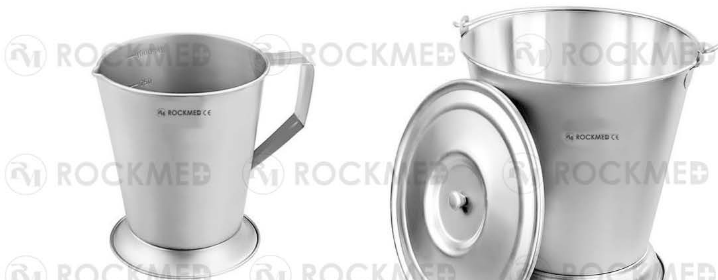
250 ml MHH.130.001 500 ml MHH.130.002 1000 ml MHH.130.003 2000 ml MHH.130.004