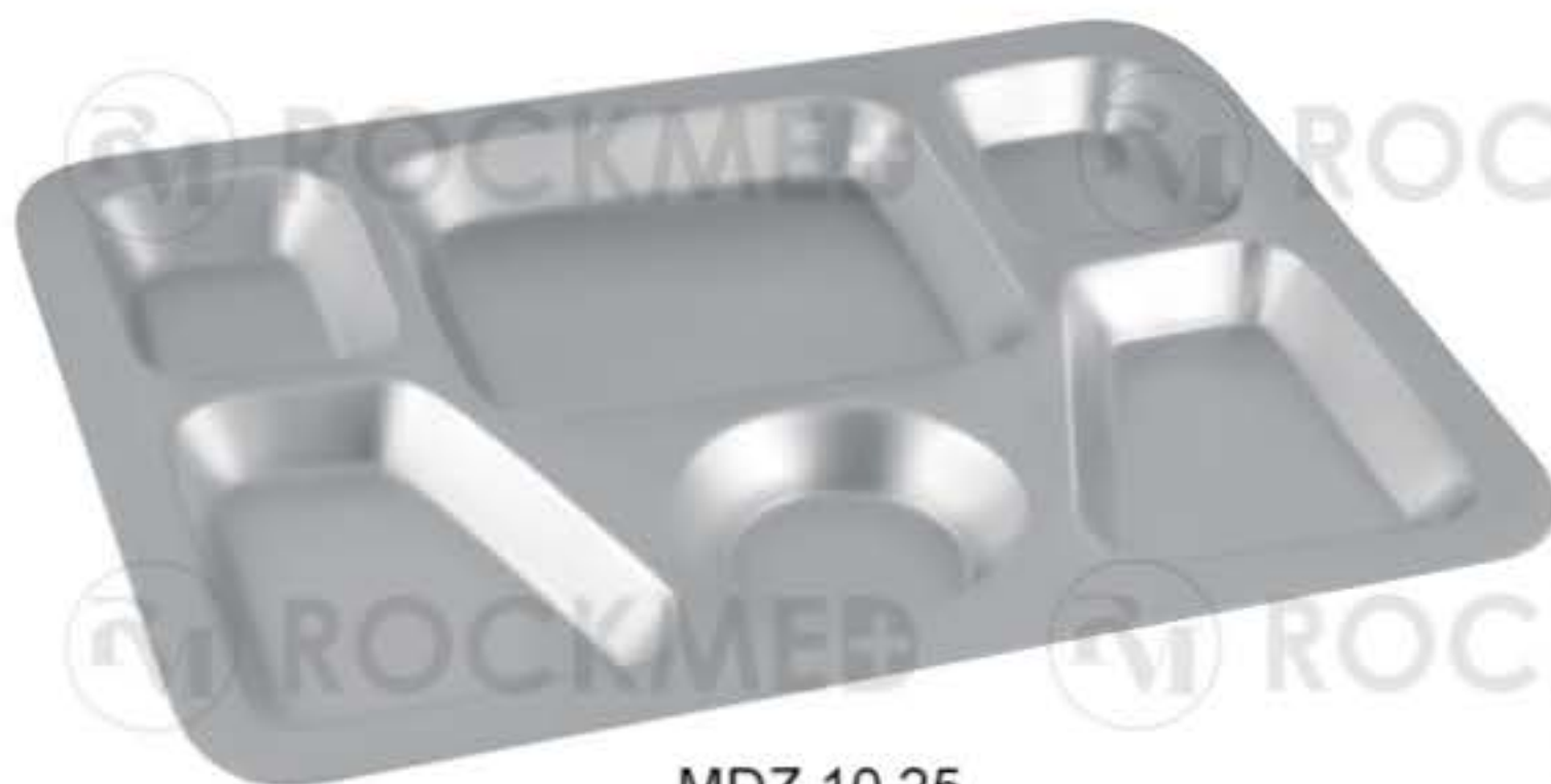
MDZ.10.25 Compartment Tray 400 x 300 x 25 mm