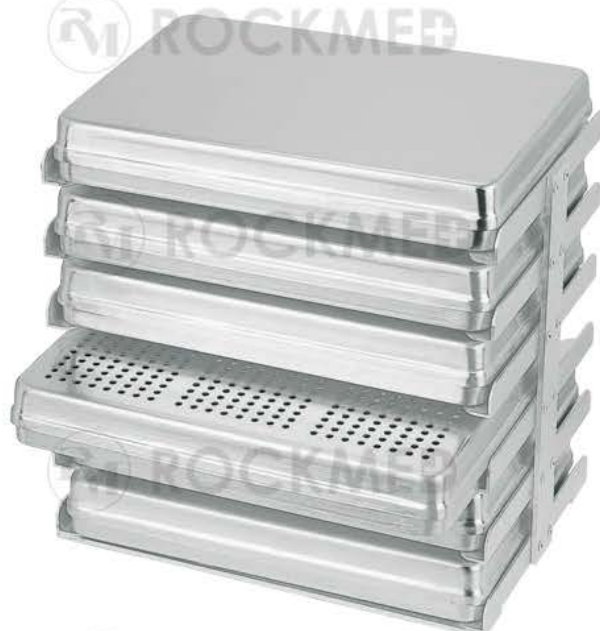
MDZ.99.29 ROCKMED Instrument tray rack -STANDARD- 6 compartments, 300 x 190 x 270mm