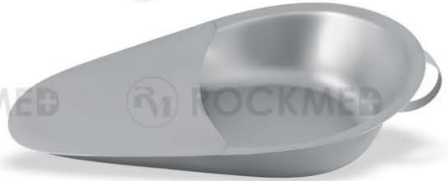
BEDPAN PERFECTION WITHOUT LID