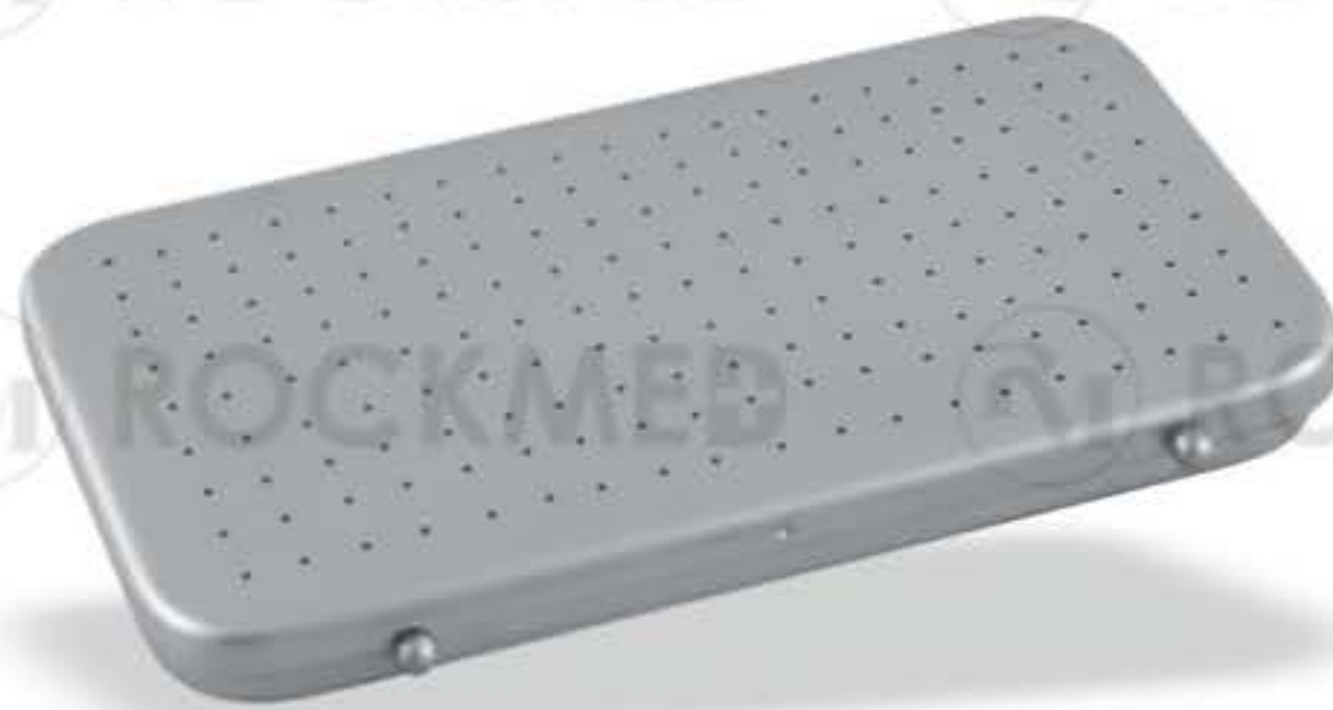
NEEDLE CASE RECTANGLE L W H 60.806.00 165 x 90 x 12 mm