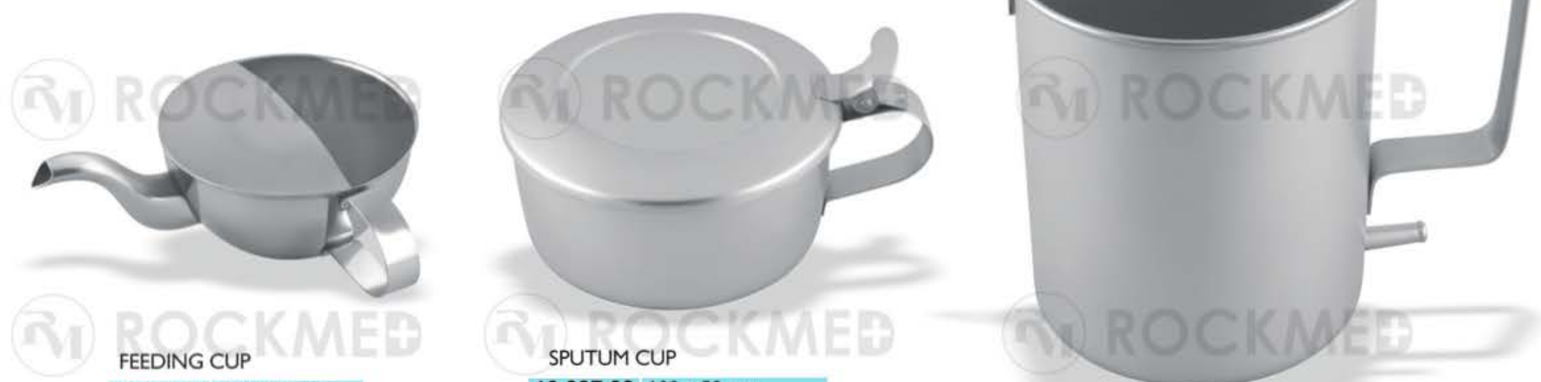
FEEDING CUP 60.882.00 142 x 50 mm