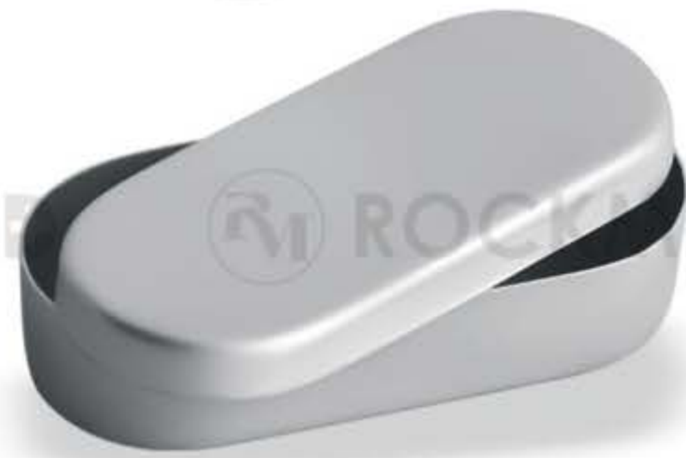
NEEDLE CASE 60.809.00 5CC 60.810.00 2CC