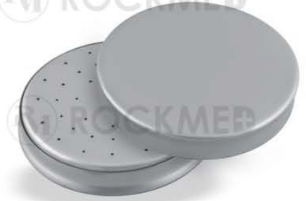
NEEDLE CASE ROUND 60.805.00