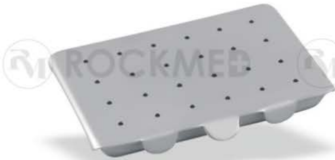
NEEDLE CASE L W H 60.811.00 50 x 24 x 4.5 mm 60.812.00 64 x 42 x 8 mm 60.813.00 75 x 25 x 4.5 mm