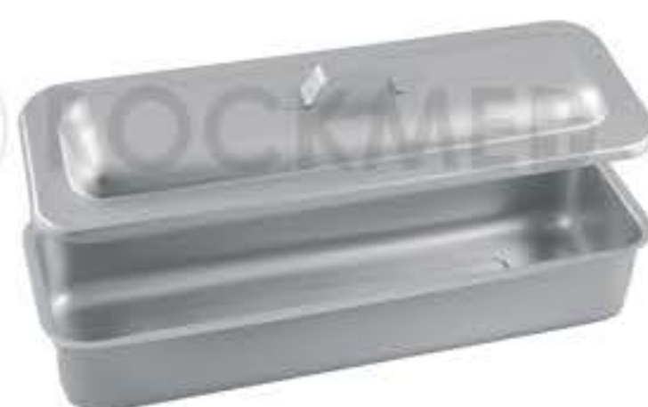
A x B x C mm A x B x C inch 230 x 130 x 50 9 x 5 x 2" MHH.107.001 300 x 100 x 50 12 x 4 x 2" MHH.107.002 440 x 115 x 50 17 x 4 1/2 x 2" MHH.107.003