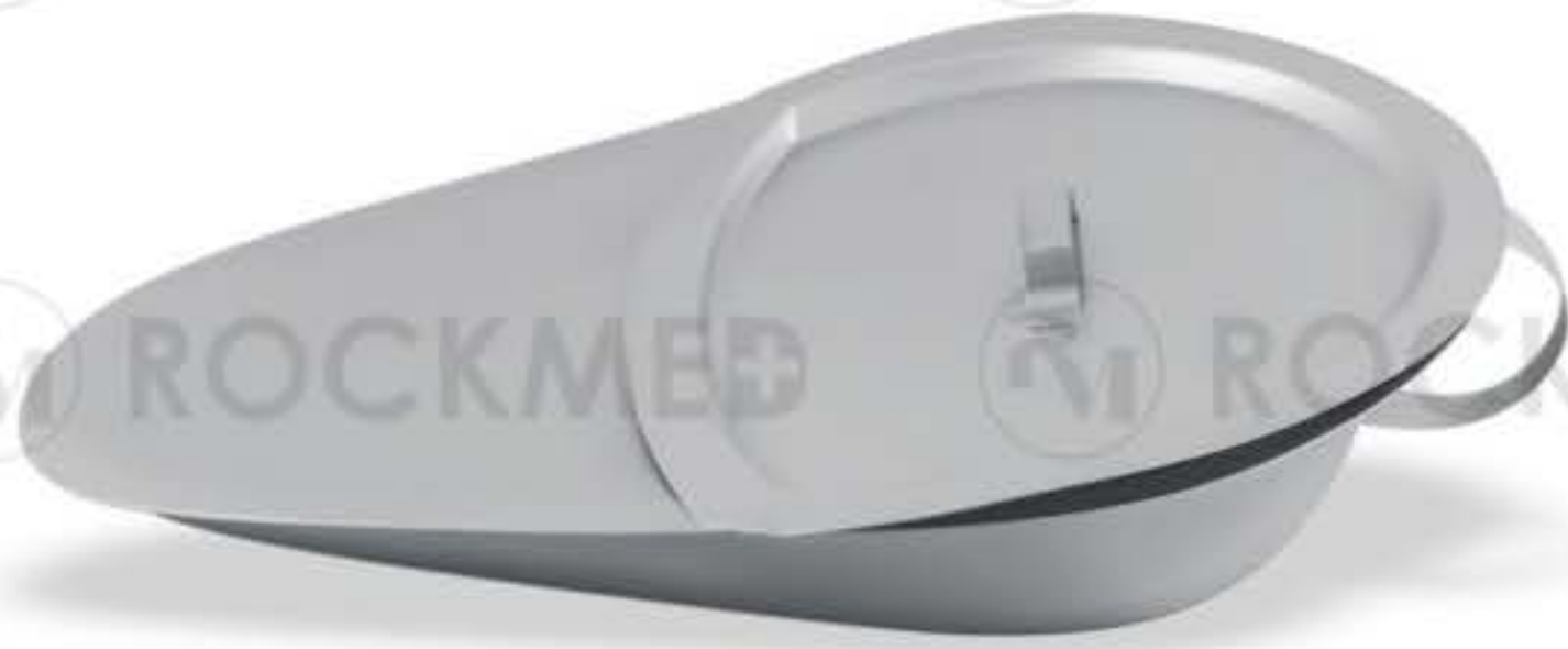
BEDPAN PERFECTION WITH LID