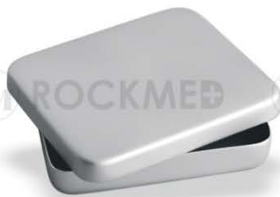
NEEDLE CASE L W H 60.808.00 165 x 90 x 12 mm