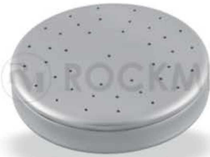
NEEDLE CASE ROUND 60.803.00