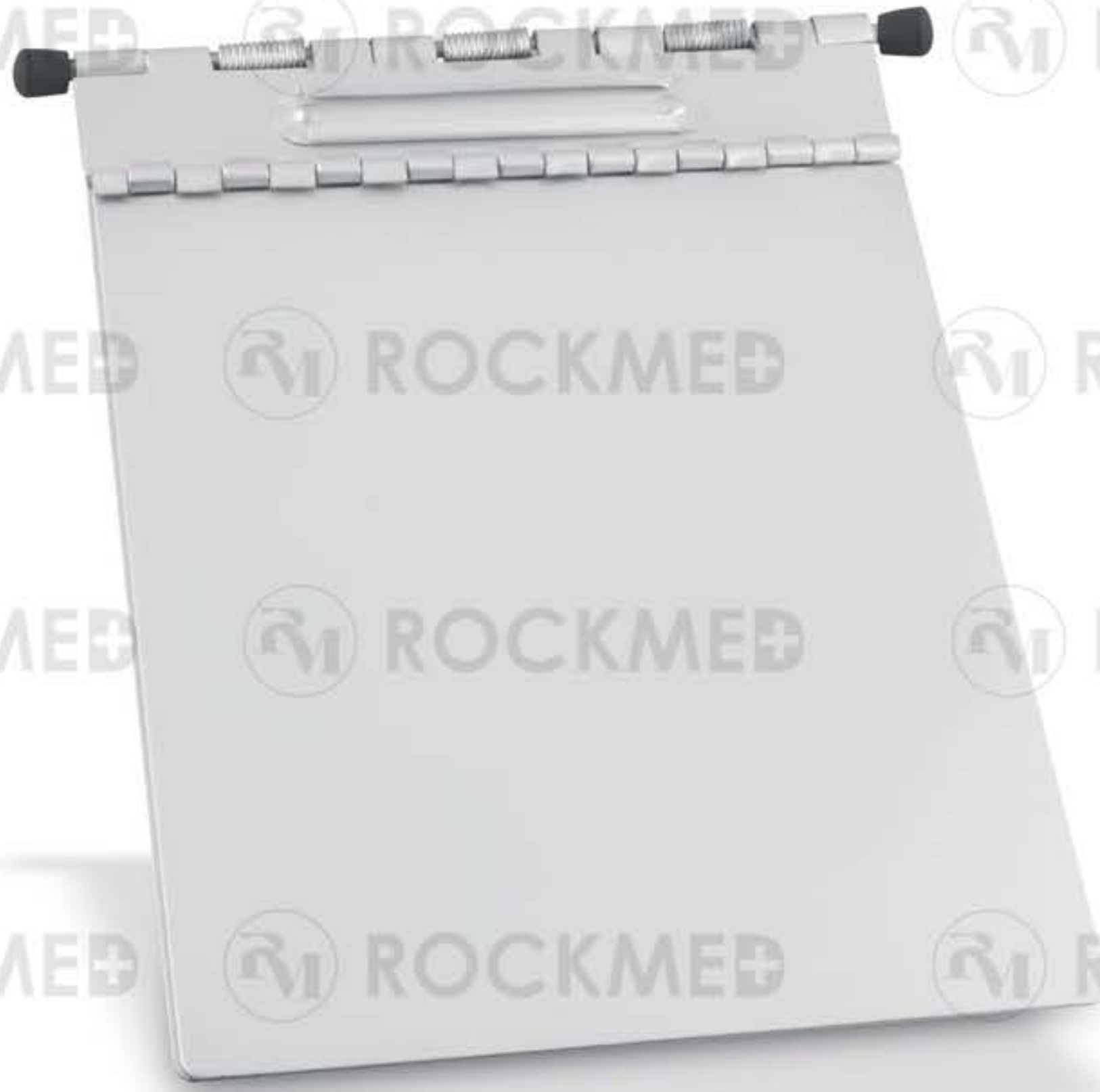
CHART HOLDER ALUMINUM 60.928.00 310 x 225 mm