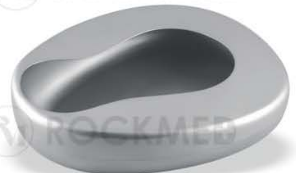
BEDPAN PERFECTION TYPE

305 x 235 mm / 12 x 9 1/4" MHH.153.001 355 x 290 mm / 14 x 11 1/2" MHH.153.002