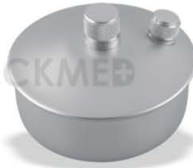
ALCOHOL LAMP 60.900.00