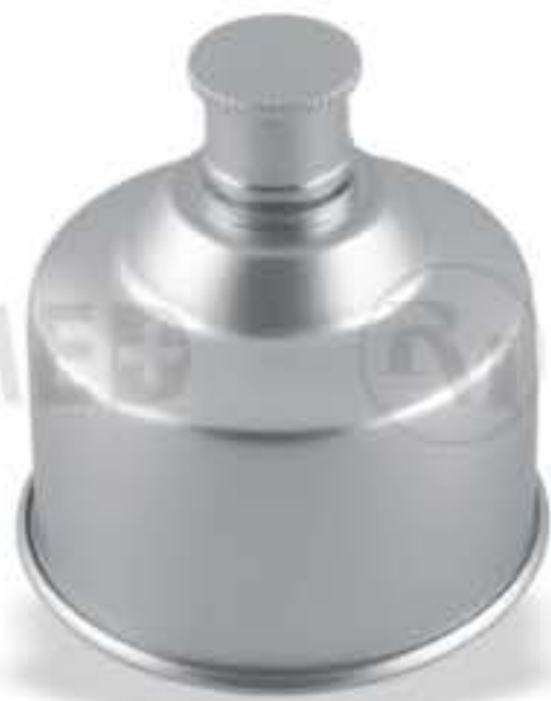
ALCOHOL LAMP 60.899.00