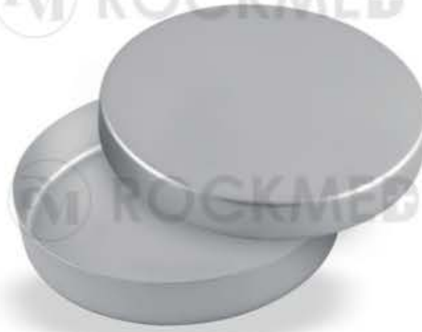
NEEDLE CASE ROUND 60.804.00