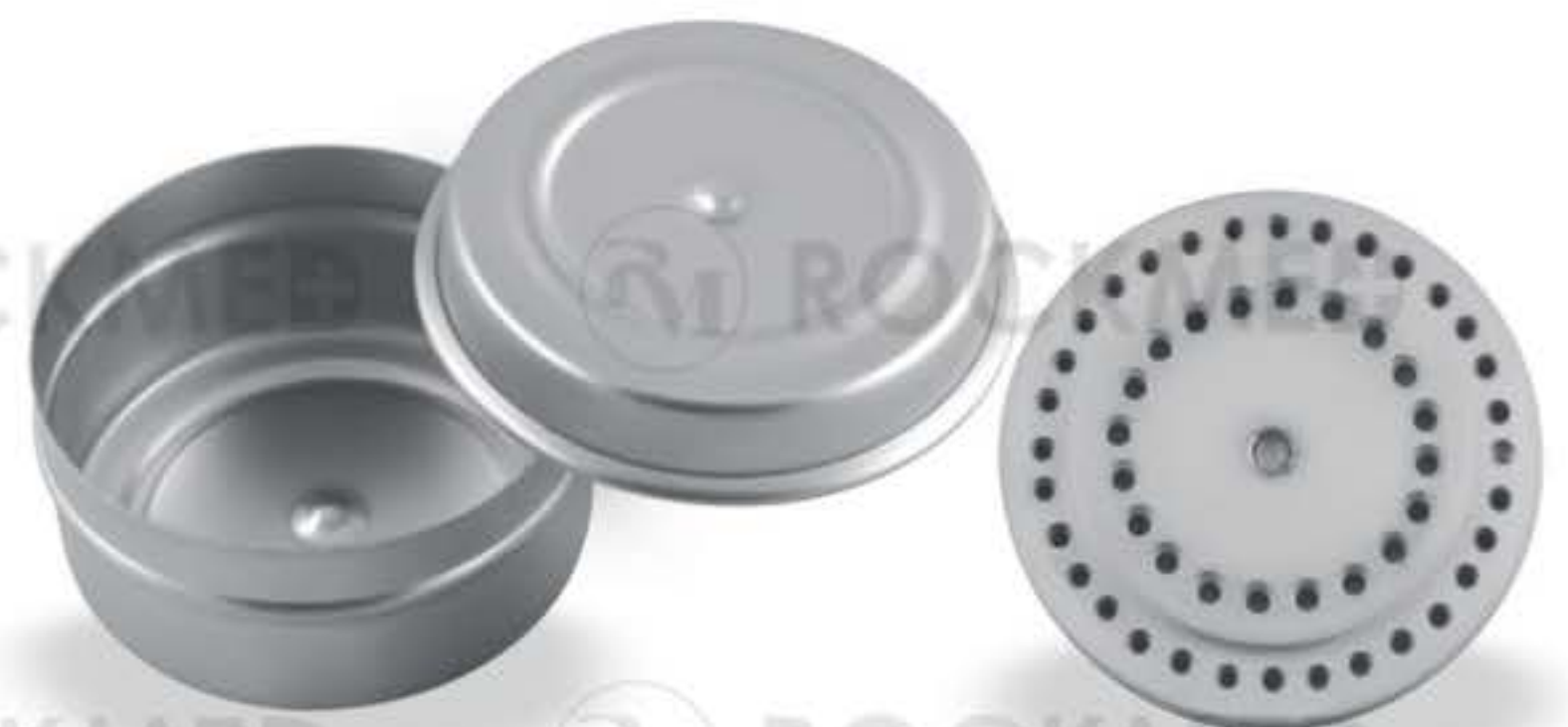
BUR HOLDER ROUND 60.814.00 With Silver Plate